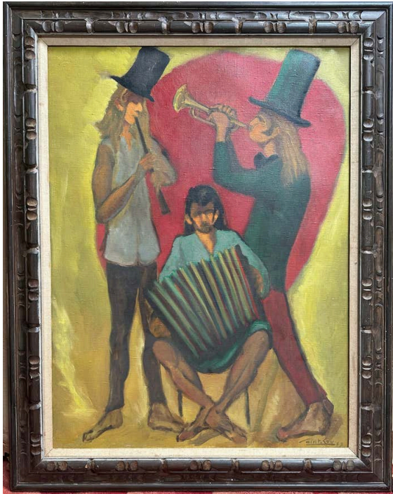
"Three Musicians" Midcentury Oil Painting by Maurice Saint-Lou