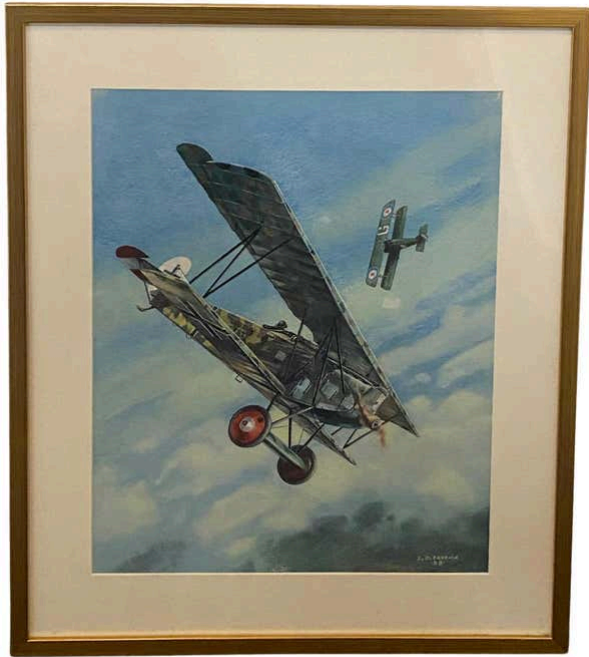
"Sky Battle" Airplanes Litograph by J.D. Carrick