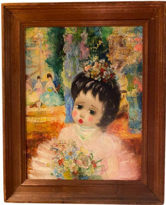
"Porcelain Doll in a Ballet Dream", Painting by Santini Poncini