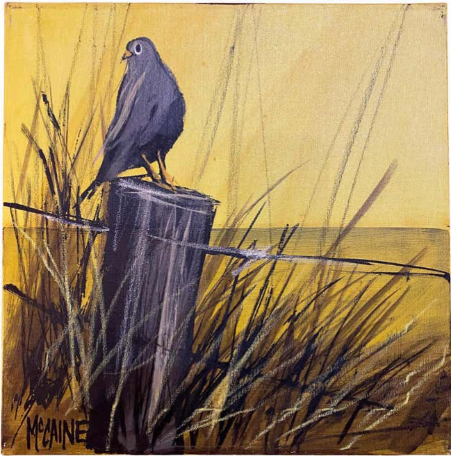
"Pigeon at Sunrise" Animal Acrylic Painting on Yellow Background by Ian McCaine