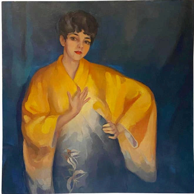
Acrylic Modern Portrait of Lady in Yellow Kimono